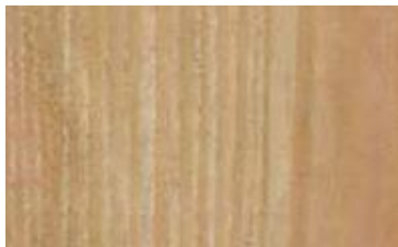
Microshades - Classic brown New - no weathering