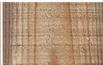
Redwood - Untreated 10 Months weathering