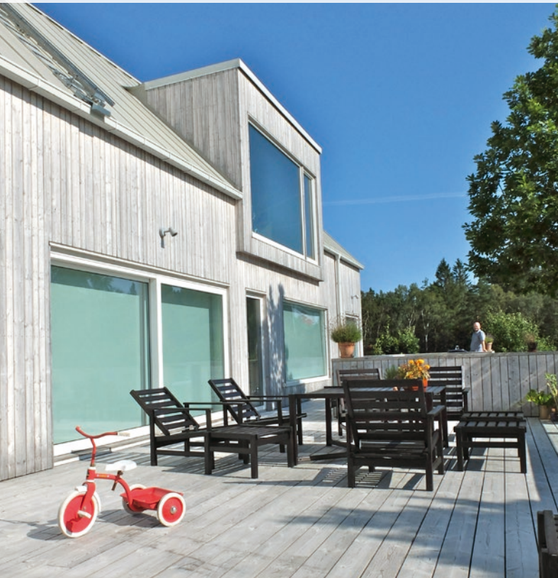
SIOO impregnated spruce. Karlsson Wachenfeldt Architects.