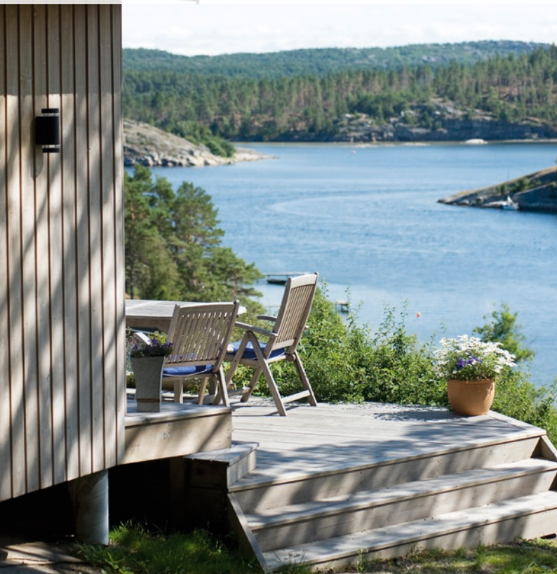
Larch panel, teak furniture. Uddevalla, Sweden.